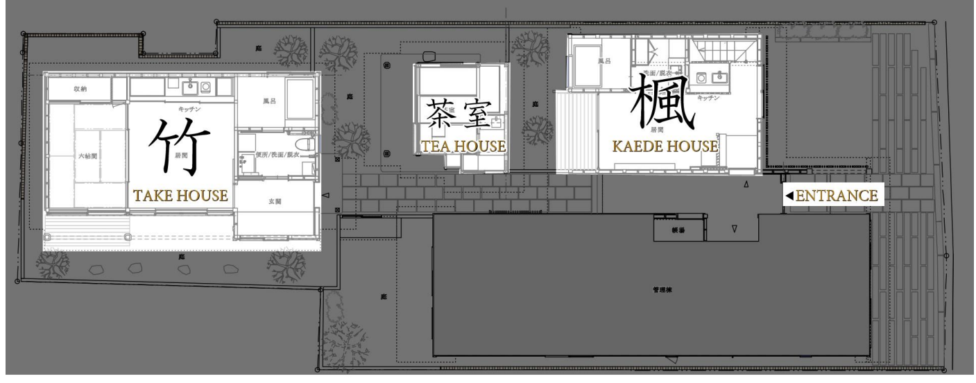
\times "TAKE HOUSE" is a one-storied house and "KAEDE HOUSE" has two stories.

We have 2locks, 1<sup>st</sup> is at the entrance. 2<sup>nd</sup> is at the door of each houses. I will tell you the number in message.